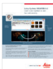
Leica Cyclone REGISTER