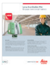
Leica ScanStation P16

Illustrations, descriptions and technical specifications are not binding. All rights reserved. Printed in Switzerland – Copyright Leica Geosystems AG, Heerbrugg, Switzerland 2015. 832253en-us – 03.15 – INT